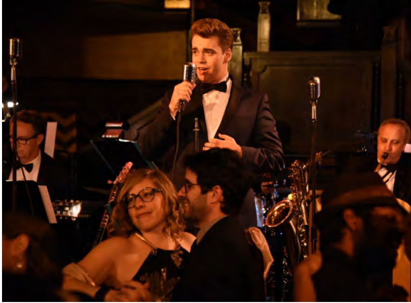
Performing for a sold out crowd at the Cicada Club