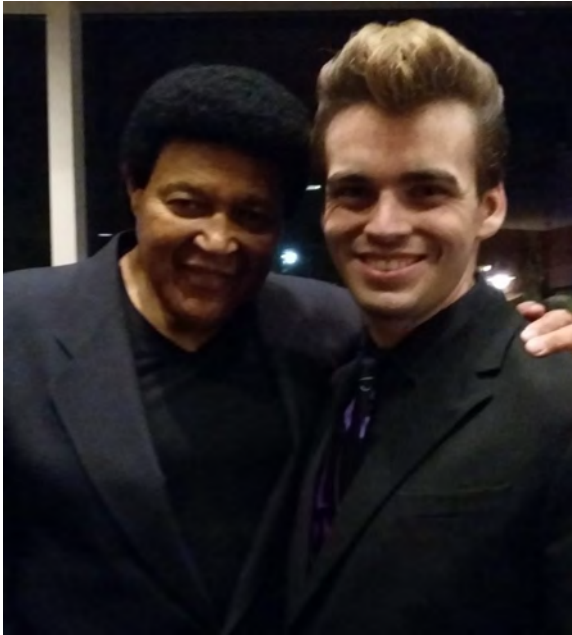
The Legendary Chubby Checker