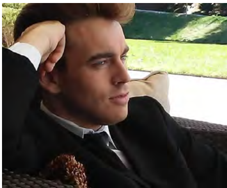
That quiet time before a show