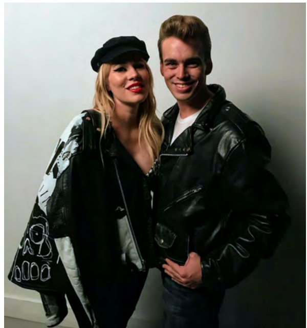
The beautiful Natasha Bedingfield