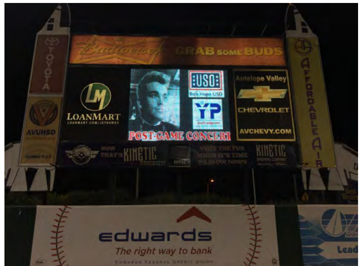
Performing a post game concert to benefit the "USO"